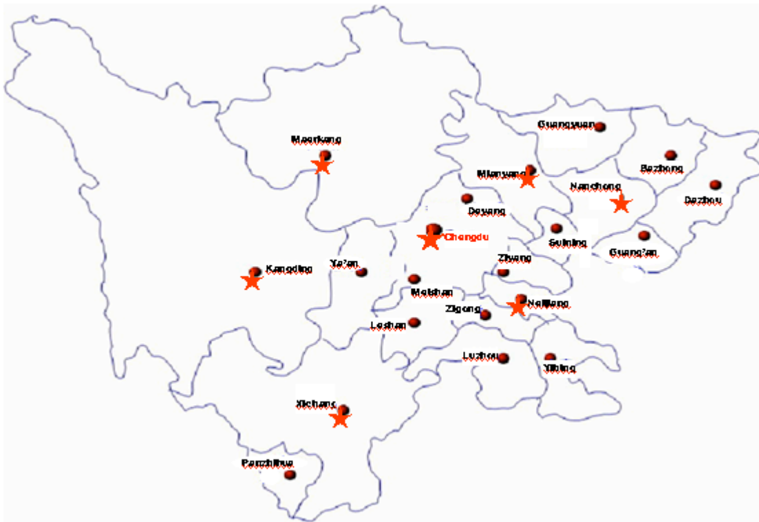
Figure 1. STC’s service areas in Sichuan Province, China